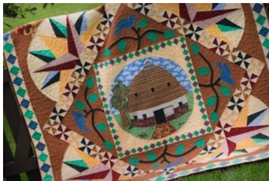
Quilt: Down Home Memories!

Currently I am creating a 'quilter's dozen' of quilts for a trunk show which will depict my life and the life of those whom I love while demonstrating the numerous techniques I've come to love over the years. My desire is to spark the love of sewing and quilting within the hearts of as many people as I possibly can, while I can!